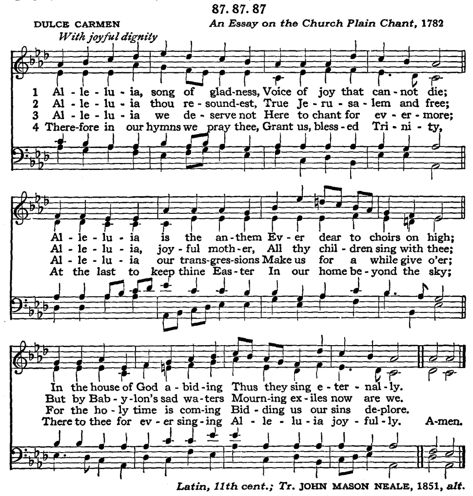
54 (For the last Sunday after Epiphany)

Closing Prayer Response: Thanks be to God.